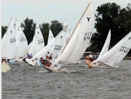
International Y-Flyer Regatta on Chippewa Lake

Monday, August 2, through Sunday, August 8, 710 W. Smith Rd., Medina Blake Shelton & Chris Cagle concert on Wednesday, August 4, at 8:00 PM. Visit medina-fair.com for a complete list of events.